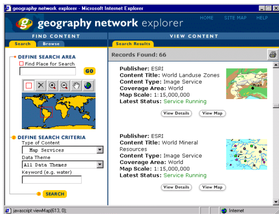
Click "View Map" to Display Map

Once a map service is registered and reviewed by the Geography Network team, it will be made available through the Geography Network Web site. Web users can access the map service using the Geography Network Explorer application available on the site. The Geography Network Explorer is a custom Web application that is built to request map images from remote map servers. With the Explorer, users can perform basic pan and zoom operations on map services as well as generate printable versions of the maps including legends.