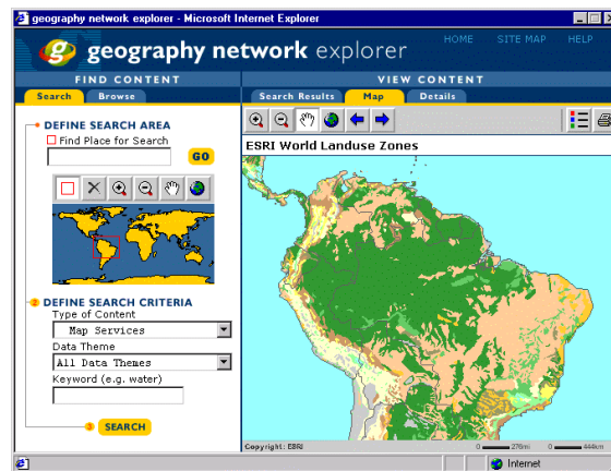
Navigate Map Service

If the map service is published with ArcIMS, GIS users can access the services using software such as ArcView 8.1 or ArcExplorer 3.1 Java Edition. Each of these software packages is fully integrated with the Geography Network and can access map services through a customized version of the Geography Network Explorer. Users are only enabled to access "public" map services that are registered with the Geography Network. Publishers may restrict access to their map services, if desired, using the security tools built into ArcIMS 3.1.