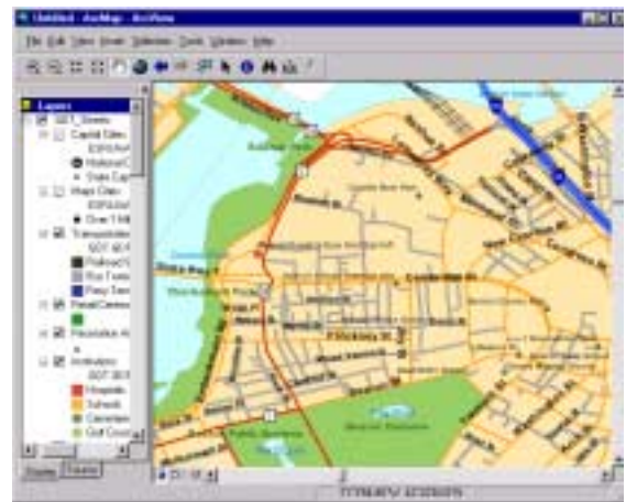
U.S. Street Map Service Displayed in ArcView 8.1